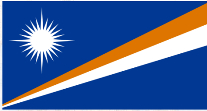
AUSTRALIA - URMILA