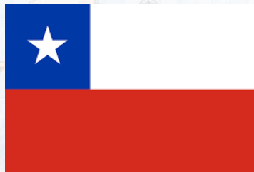
CHILE - MEDHA