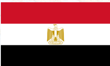
EGYPT – ANEETTA