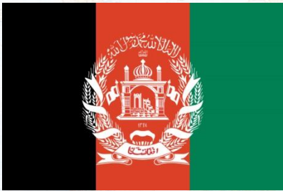
AFGHANISTAN - NEETHU